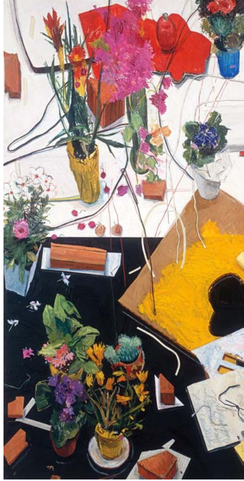
Manny Farber, Cézanne avait écrit, 1986, oil on board