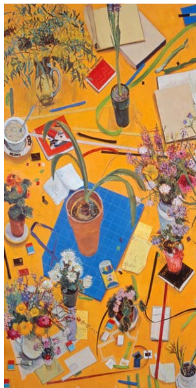
Manny Farber, Domestic Movies, 1985, oil on board

The works shift time periods and places drawing lines of thought as well as seeking new collisions and ruptures,