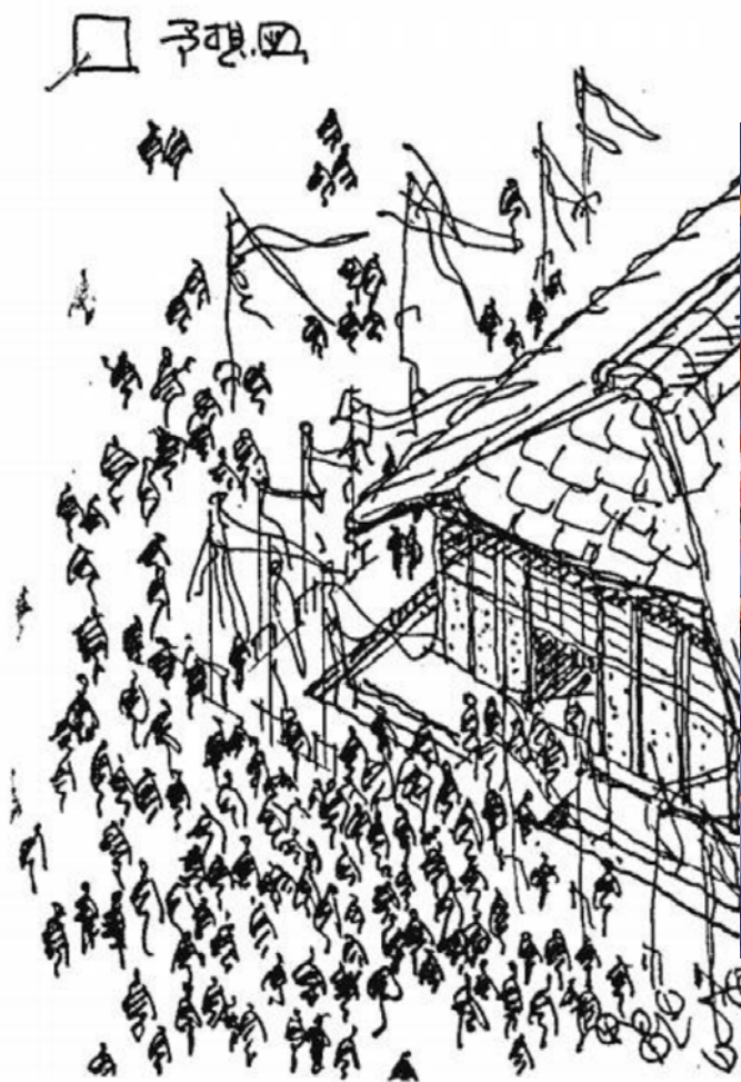
Ogawa productions design for The Theater of a Thousand Years [Sennen shiataa] c.1987