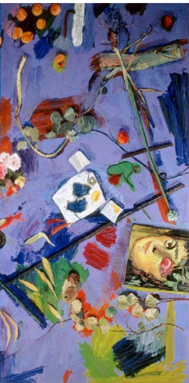
Manny Farber, New Blue , 1993, oil on board